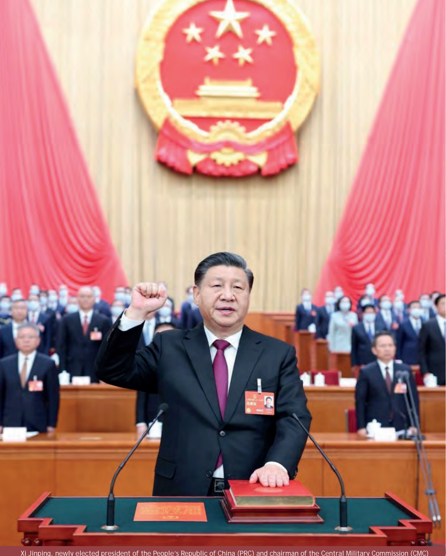
Xi Jinping, newly elected president of the People's Republic of China (PRC) and chairman of the Central Military Commission (CMC) of the PRC, makes a public pledge of allegiance to the Constitution at the Great Hall of the People in Beijing, capital of China, March 10, 2023. Xi was unanimously elected president of the People's Republic of China and chairman of the Central Military Commission of the PRC at the third plenary meeting of the first session of the 14th National People's Congress (NPC).