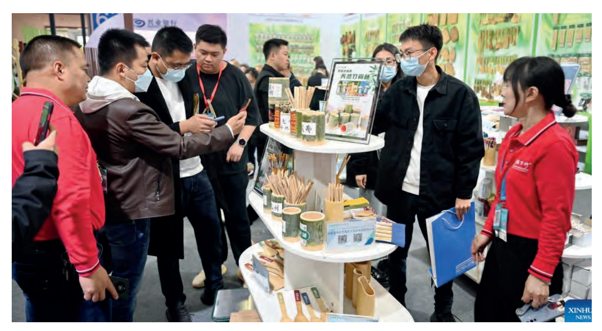
Visitors learn about bamboo and wood products at the 2023 China Cross-border E-commerce Trade Fair in Fuzhou, southeast China's Fujian Province, March 18, 2023.

Consequently, the annual "two sessions" -- or Lianghui -- which commenced over the weekend, ignited a palpable sense of excitement and optimism for the country's future, as a series of development targets for