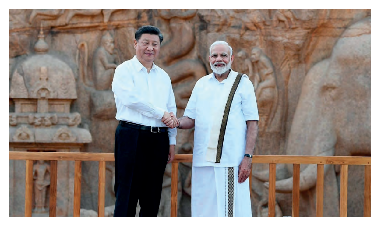
Chinese President Xi Jinping and India's Prime Minister Narendra Modi in Mahabalipuram.

The year 2023 marks a high point in India's diplomacy, with its presidentship of the Shanghai Cooperation Organisation (SCO) and the G-20. The focus is also on China which held "two sessions" recently: the annual sessions of the National People's Congress of the People's Republic of China and the National Committee of the Chinese People's Political Consultative Conference. Here are some insights into China's development. China is advancing the modernisation on all fronts. Here, the path to modernisation is based on