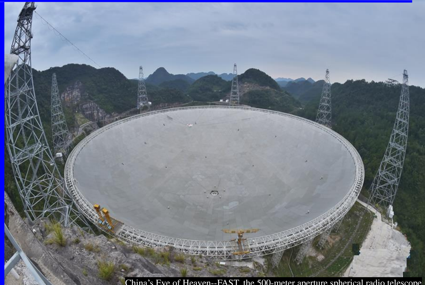
China's Eye of Heaven--FAST, the 500-meter aperture spherical radio telescope

--Achievements accomplished on the 70th anniversary of the founding of the People's Republic of China